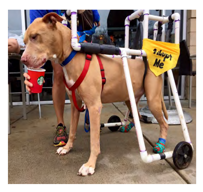
Figure 1: Volunteers knew that getting a 'puppachino' was French Fry's favorite way to end an outing

The shelter has several trained volunteers who assist with the power hour program. These volunteers arrive at the shelter before the power hours begin, assist in matching fosters with dogs, help fosters gather needed supplies, and check power hour fosters in and out via the shelter's software, saving the foster coordinator's time.