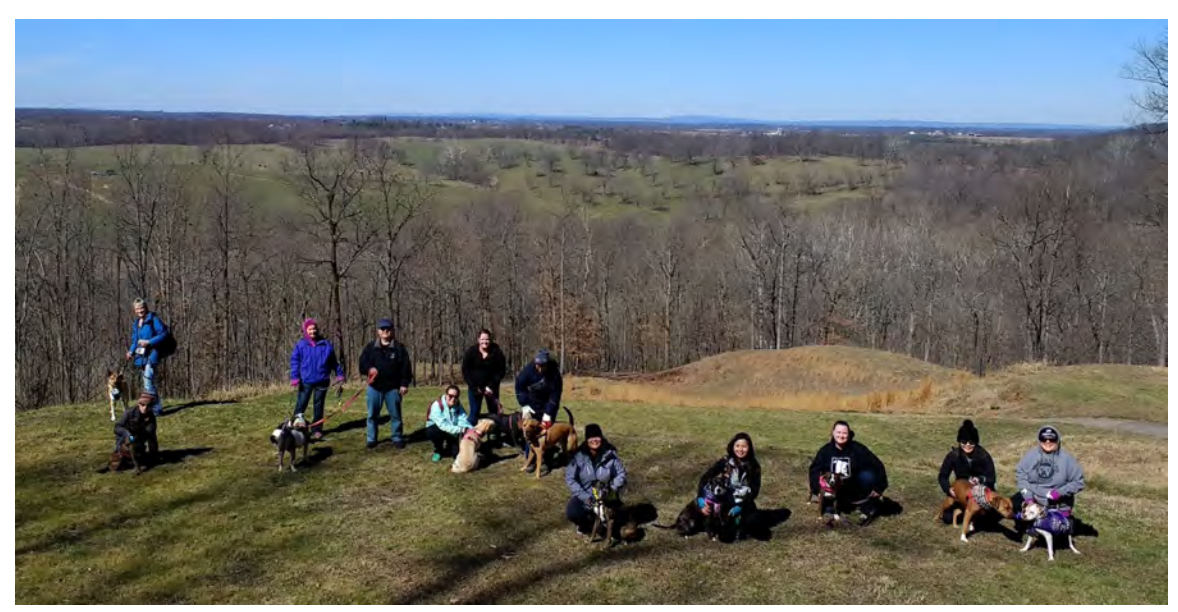
Figure 2. ResQCrew by NOVA Pets Alive is a volunteer-run walking group. In addition to community members joining the group for walks, local shelter fosters often bring their foster dogs on walks for added socialization and to learn more about them.